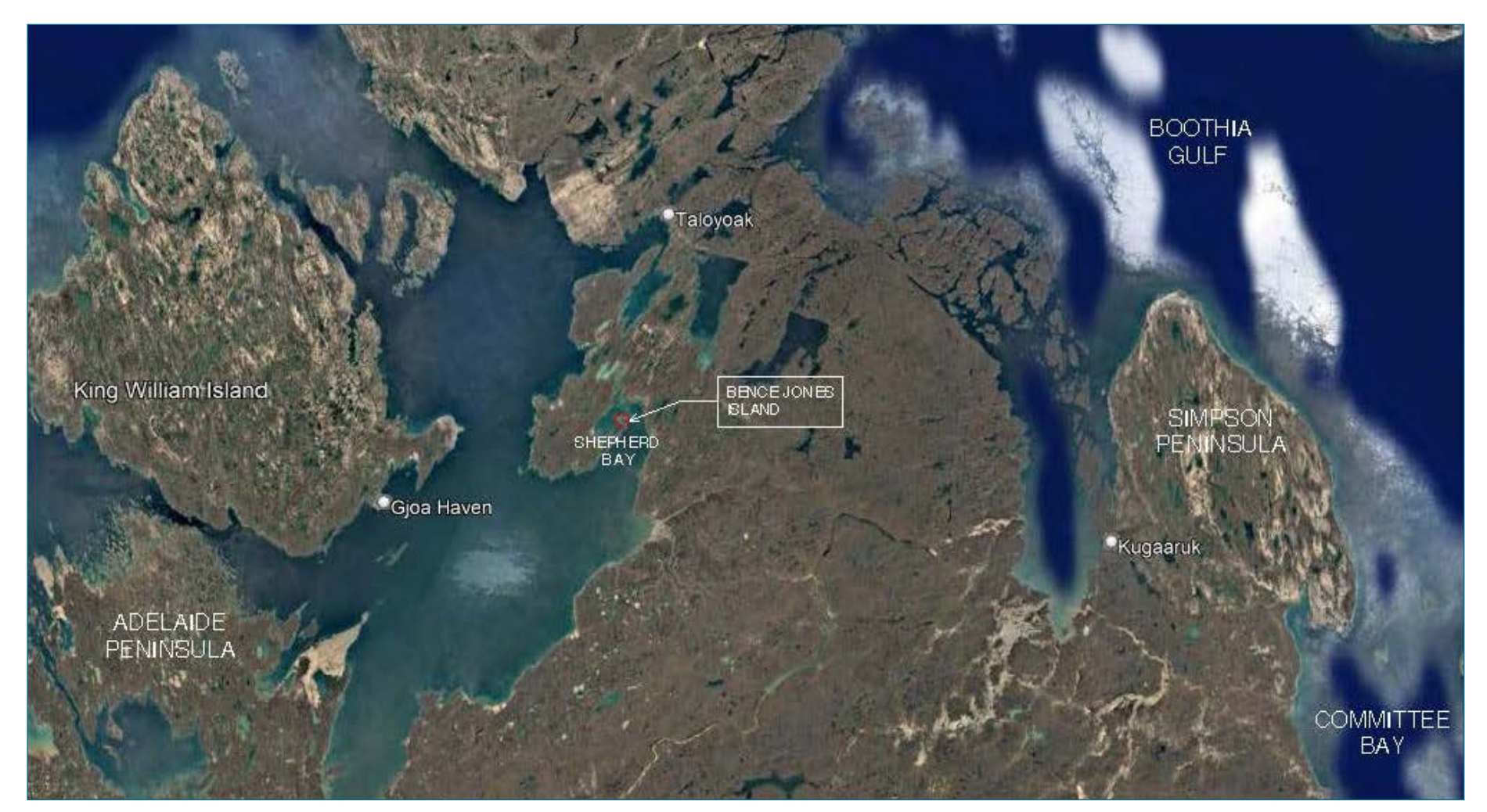
Figure 3. The region of North America in which John Rae's search to locate Sir John Franklin's lost expedition was conducted, as seen using Google Earth Pro (July 26, 2022). We show the location of Bence Jones Island based on Captain John Rae's approximate coordinates of longitude and latitude as cited in the excerpt of his report in our text and shown in Figure 1. We use the term "approximate coordinates" because Rae's coordinates were only to the nearest arc minute of latitude and longitude, which is approximately one mile. On May 25, 1993, an agreement was reached that gave the Inuit control over the central and southern portion of the Northwest Territories, now referred to as Nunavut. Some of the English names assigned by Rae and other British explorers in that region may not be used by the Inuit.