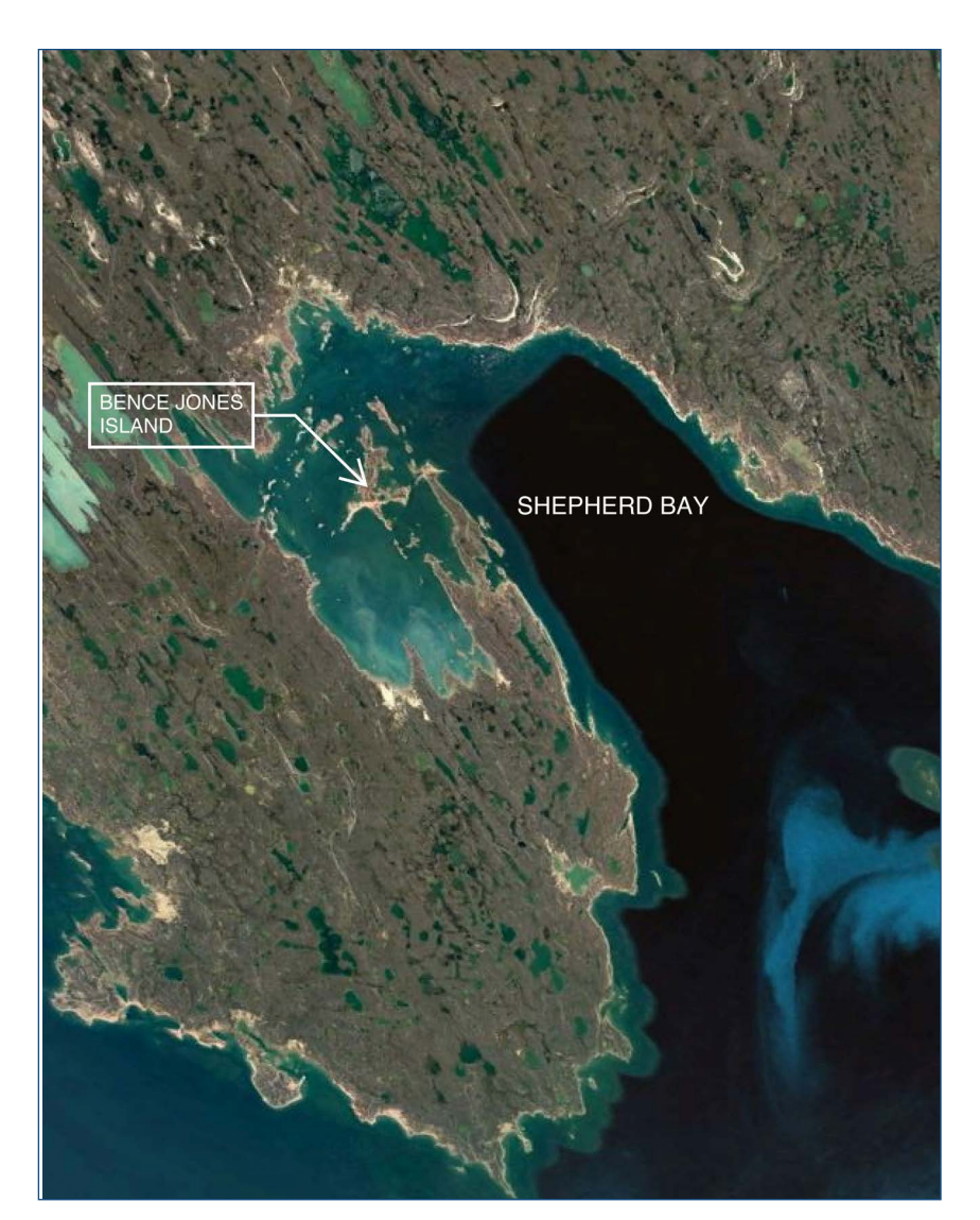
Figure 4. Enlarged image of the site of Bence Jones Island at the head of Shepherd Bay shown in Figure 3, based on Captain John Rae's approximate coordinates of latitude and longitude as cited in the excerpt of his report in our text and derived from Figure 1. We use the term approximate coordinates because Rae's coordinates were only to the nearest arc minute of latitude and longitude, which is approximately one mile.