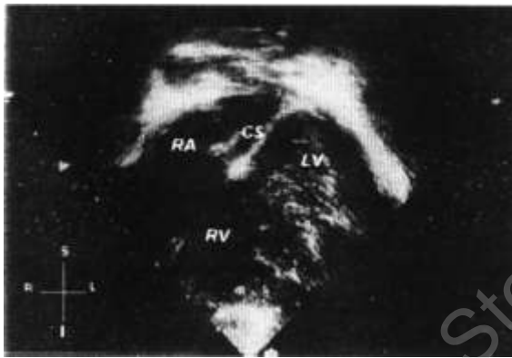
Figure 2. The RAT is no longer evident after 7 days of UK infusion (day +28 after catheter placement). RA= right atrium, CS=coronary sinus, LV=left ventricle, RV=right ventricle.

complications nor pulmonary embolism symptoms occurred. Chest X-ray was normal. Fibrinogen, whose baseline value was 382 mg/dL (Clauss method), remained within the normal range (130-400 mg/dL) except for a single value of 109 mg/dL which coincided with the above mentioned minor bleeding. No hemorrhages were observed during heparin therapy.