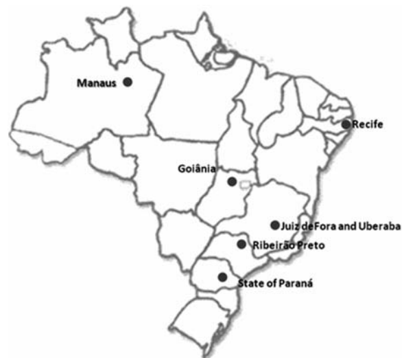
Figure 1. Location of Brazilian study sites.

All the patients with acquired AA included in the study had been living in the area covered by the study site for more than three months, and had undergone peripheral blood testing and bone marrow study. All the patients were submitted to peripheral blood count, bone marrow aspiration, and/or bone marrow biopsy. All the patients under two years of age were submitted to a specific test to exclude Fanconi anemia. The eligible patients were those who met at least two of the three