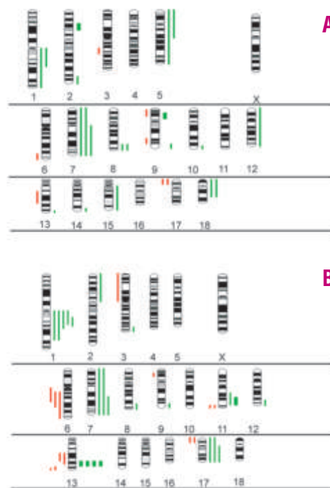
Figure 2. Ideograms of the distribution of gains and losses of genetic material in adult (A) and pediatric (B) Burkitt's lymphoma.

In a previous study, 4 we had defined gene expression signatures that distinguish BL from DLBCL. In particu-