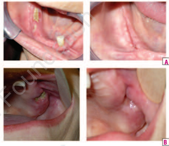
Figure 2. Photographs of the jaw of patients showing two examples each of (A) complete and (B) partial response to therapy.

applications. Questionnaires were administered to patients to evaluate pain, secretions and halitosis (each scored on a scale of 1 to 10) before and after treatment (Figure 1). The study was approved by the ethical committee, the Declaration of Helsinki was adhered to and all patients gave informed consent.