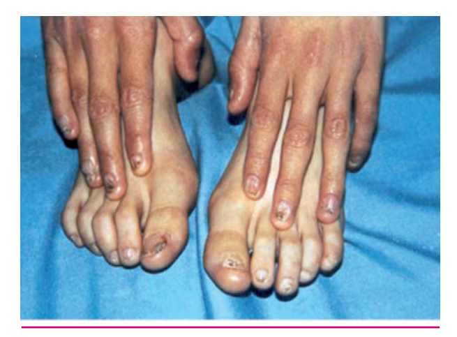
Figure 1. Nail dystrophy with complete loss of nail plate.

A 12-year-old boy was referred for evaluation of pancytopenia and failure to thrive and delayed psychomotor development. The patient was born as the third child of the family after an uneventful pregnancy at 39 weeks of gestation, with slightly intrauterine growth retardation (weight 2400 gram, length 44 cm and head circumference 32 cm). However, no serological and clinical evidence of intrauterine infection was found. His parents were cousins and they had three sons. Elder brother of our patient admitted with the symptoms of growth failure, mental retardation, microcephaly and seizures. He had been followed in pediatric neurology department for his mental retardation and seizures but his electroencephalogram (EEG) was normal. Also he had had partial alopesia and nail dystrophy. In follow up time, his blood counts altered and pancytopenia was detected in the hemogram (leukocyte count 3400/µL, hemoglobin 6.6 g/dL and