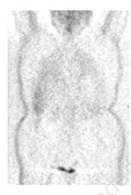
Figure 3. <sup>18</sup>F-FDG PET studies before and after chemotherapy in a case of highgrade NHL remaining in clinical CR after a follow-up of 40 months. On the left, many cervical, mediastinal and retroperitoneal lymph nodes as well as splenic infiltration can be seen at diagnosis. On the right, no residual abnormal <sup>18</sup>F-FDG uptake was observed after 3 cycles of chemotherapy. Physiological uptake of <sup>18</sup>F-FDG in the kidney and bladder was observed.

ing 16 patients that <sup>18</sup>F-FDG PET is more accurate than CT in the nodal staging of lymphoma patients. <sup>12</sup> A confirmatory study including 27 patients with Hodgkin's disease and 33 patients with NHL was reported by Moog et al. <sup>13</sup> PET showed lymphomatous involvement in 25 additional sites compared to those shown by CT (7 true positives, 2 false negatives, 16 unresolved). CT also showed some additional regions involved compared to those revealed by PET (3 false-positives, 3 unresolved). Staging was changed due to PET in 4 patients. <sup>18</sup>F-FDG PET imaging may also provide more information than CT for the detection of extranodal lymphoma. <sup>14</sup> In addition, <sup>18</sup>F-FDG PET could also detect bone marrow involvement not shown by bone marrow biopsy. <sup>15,16</sup>