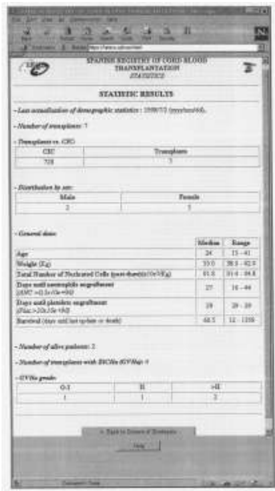
Figure 3. Example of real statistics on transplants performed by one TC automatically calculated by the system.

although these are not difficult to do. The program could also be used to support a single multinational Registry, although it may be anticipated that managerial functions would become rather cumbersome as the Registry grows.