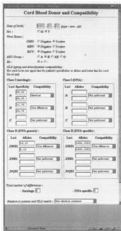
Figure 4. Example of the screen of a case record showing compatibility data.

Clinical trials and technological development in the field of CBT may be facilitated by the development of Registries for accrual of uniformly formatted data derived from patients transplanted according to common protocols. 6 The WWW supported program we have developed may allow more efficient functioning of Registries, guaranteeing confidentiality, data protection, automated controls of coherence and congruence and offering descriptive statistics capabilities. The use of WWW support facilitates the maintenance of Registries since no local installations or updates are required, and data entry is much simplified. Direct