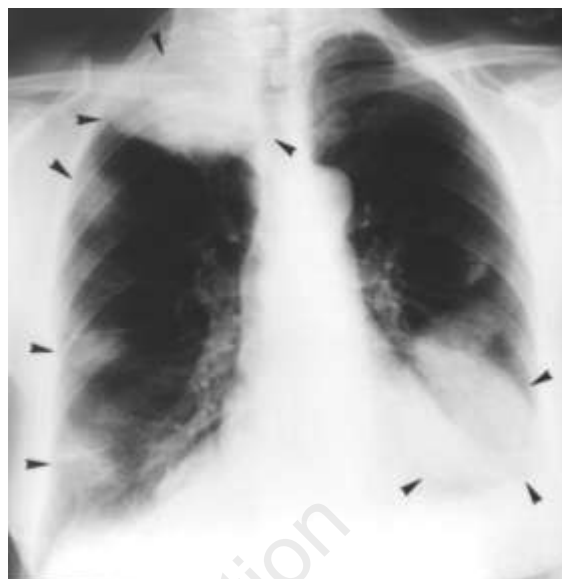
Figure 1. Chest radiography before the treatment. Multiple pulmonary opacities (arrows) are evident in both pulmonary fields. Very large lesions, 8 cm in diameter, are localized in the upper right lobe and in the lower left one.

In June 1995, a 55-year-old woman began complaining of great-joint arthritis and erythema nodosum. Her chest radiography showed multiple, large opacities involving both the lungs (Figure 1). Myasthenia gravis had been diagnosed 20 years before and pyridostigmine was continuously taken thereafter, with good control of the neuromuscular symptoms. Laboratory analyses included elevated ESR; monoclonal M- \gamma -globulin; antiacetylcholine receptor antibodies; absence of serum markers of cancer; normal values for hemochrome and other routine tests. Total CT-scan showed multiple, solid opacities with diameter up to 8 cm within both the lungs; liver, spleen and lymph nodes were normal. Fiberoptic bronchoscopy showed a pervious bronchial tree. Transbronchial biopsy was not diagnostic, whereas a surgical biopsy of the large, apical, right-sided lesion led to the diagnosis of low-grade pulmonary MALT-lymphoma according to well-recognized