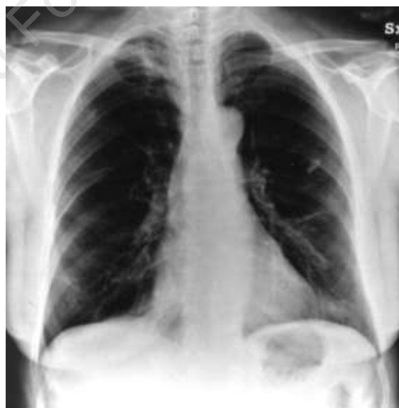
Figure 2. Chest radiography after cyclophosphamide treatment. Complete detersion of the pulmonary opacities.

histological, immunohistochemical and genetic findings. 3,4 Finally, a bone marrow biopsy showed normal hematopoiesis, without lymphoma localization.